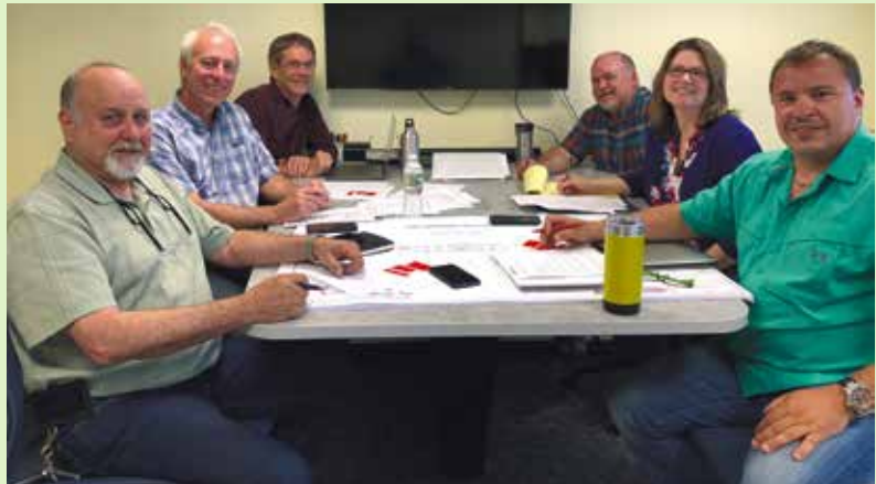
Affordable housing for Native American Elders

Rehabilitation of nine units of affordable rental housing for very low-income homeless residents who are suffering from mental illness. Services like intensive case management, transportation, and medication management will be provided to help residents successfully transition into the community.