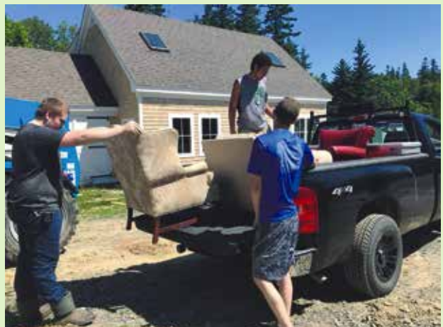
Affordable housing for rural Mainers

Capital provided to the Genesis Fund to be used as revolving loan capital for the preservation and rehabilitation of multifamily rental in rural areas.