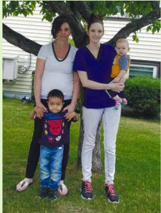
Affordable housing for families

Construction of 60 units of housing for low-income families. Energy-efficient, sustainable, and affordable housing that includes services to help people succeed and thrive—like work force readiness training, literacy programs, Head Start and after school programs.