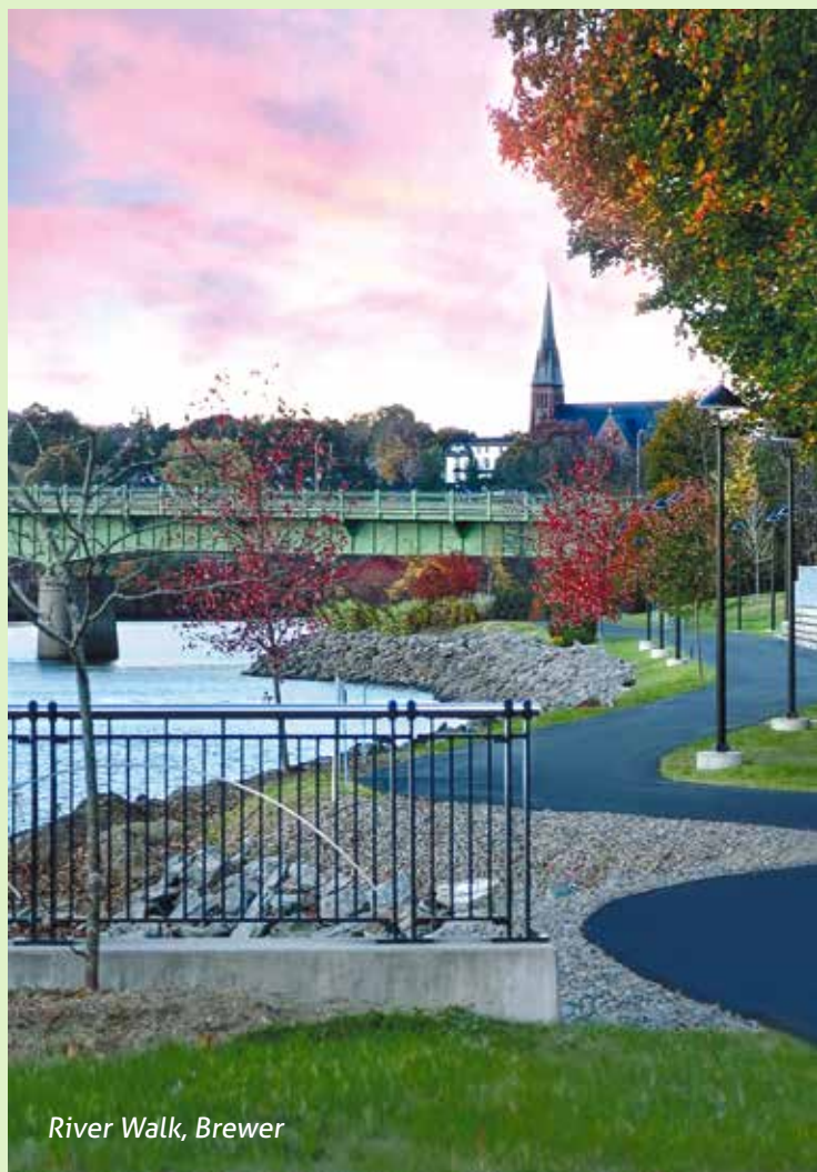
River Walk, Brewer

The conversion of the former Brewer Middle School into 28 units of housing for low-income seniors brought new life to this 1925 building. The building's historic components such as tin ceilings, bookcases, and murals were preserved in the renovation, and add to the residents' enjoyment of their new home. An on-site service coordinator assists residents with obtaining services within the community.